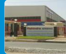
Mahindra Aero Space