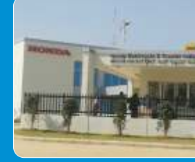
Honda Motorcycle & Scooter