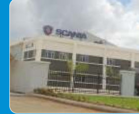
Scania Commercial Vehicles